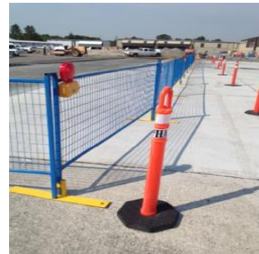
Construction Zone Fencing

The active work areas will be fenced off using medium height fencing and appropriate marking. Alpha Aviation works directly with the fence rental company to ensure appropriate access and operational control during periods of construction.